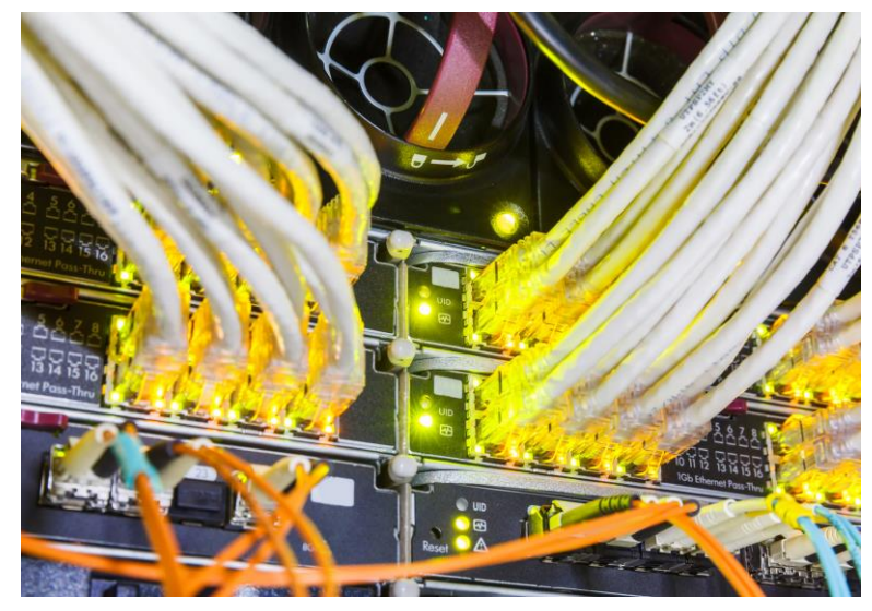
Figure 5: The rear of a heavily populated cabinet

Regardless of the way in which the cabinet level power is provided, there is a very real need to review and understand the level of redundancy and topology of the power supplies to the High Density equipment. Lower Density servers may have fairly simple, A and B power supply units, which match nicely with A and B power distribution, but, newer High Density systems are often supplied with multiple power supplies, potentially with an odd number, and with various redundancy options. Not fully understanding this can compromise the redundancy of the overall system and ultimately cause unplanned downtime. For example, within a cabinet which is provided with A and B supplies, a High Density System with 6 PSUs, at N+1 redundancy will not be being powered resiliently without additional Source Transfer Switches.