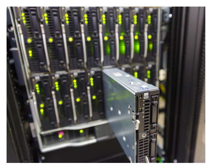
Figure 2: A typical High Density load

When we talk about 'High Density' we are referring to IT systems which have been engineered to take up a smaller physical footprint than more traditional systems and which, in turn, allows them to be grouped closer together. Using these types of approach, a typical server rack, which may have averaged 4-5kW in the past, is often now designed to accommodate 20-30kW, with higher densities possible.